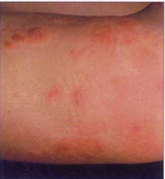
An example of an allergic reaction to urushiol. Direct contact produced redness, swelling, blistering and rash.