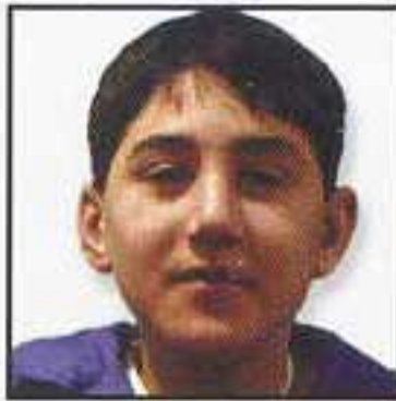
2 days after using Zanfel