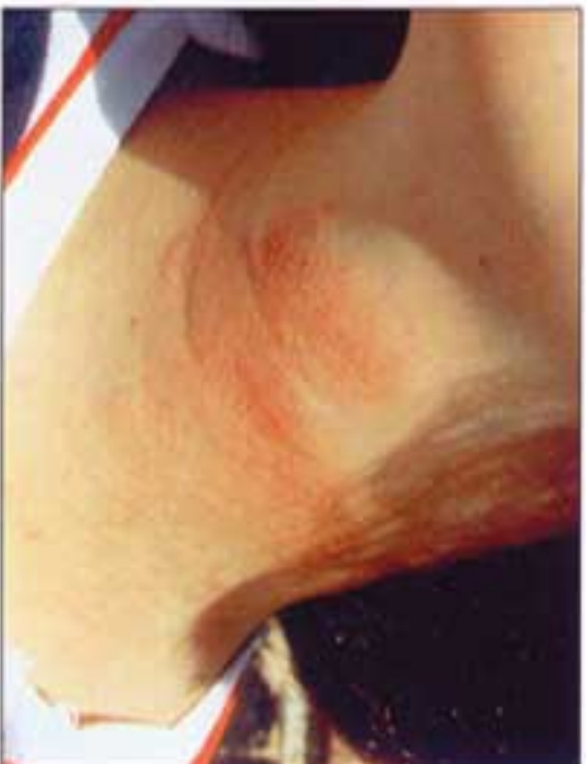
An example of a poison ivy allergic reaction. Wiping contaminated hands on the neck produced the swollen, streaky appearance.

Poison ivy, oak and sumac belong to a family of plants that produce one of the most common allergic reactions in the United States. Experts estimate that up to 70 percent of the population is allergic to urushiol (you-roo-shee-ol), the oil found in the sap of these plants. The reaction, known as "urushiol-induced allergic contact dermatitis," occurs when urushiol attaches itself to the skin after a person's direct or indirect exposure to the oil. Symptoms like rashes, oozing blisters, itching and swelling are the body's way of telling you that you are having an allergic reaction.